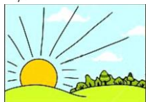
buenos días (good morning)